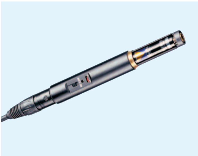
Cable pictured is an accessory not supplied with the powering module

The K6 powering module is the heart of this Sennheiser professional modular microphone system and can be powered either by its internal 'AA' size 1.5 V battery or by 12 – 48 V phantom power. The K6 can be combined with different condenser microphone heads to provide a wide variety of polar patterns. Matt black, anodised scratch-resistant finish.