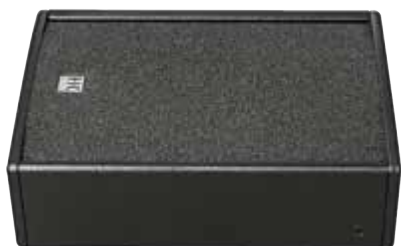
PR:O 10 XD

This truly multifunctional cab gets the job done nicely as a satellite, as a compact 10"/1" fullrange cabinet, or as a low-profile stage monitor. Its balanced frequency response defeats feedback and the Music/Speech knob tunes the unit for the given application. The integrated DSP-based power circuitry delivers 1,200 watts. And all this makes the PR:O 10 XD a powerful and flexible sound reinforcement tool.