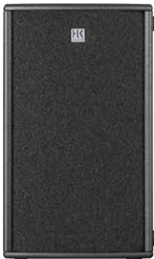
PR:O 210 SUB A

Featuring two 10" woofers in a bass reflex enclosure, this unit pumps out impressive low end with plenty of kick and surprising depth. Remarkably compact and weighing just 27.2 kg, this versatile unit may be placed upright or sideways. It is readily combined with mid/high units to configure a powerful yet unobtrusive easy-to-use system that delivers outstanding performance. In addition to the 600-watt power amp, the PR:O 210 SUB A is equipped with a stereo preamp for 2.1 setups.