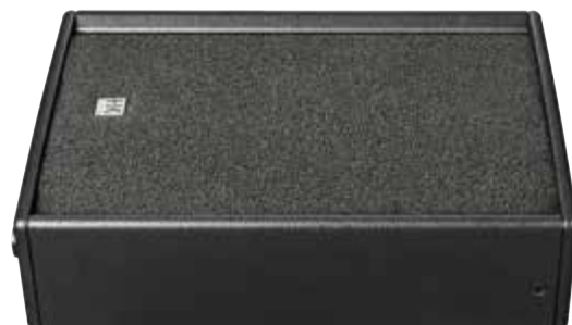
PR:O 12 XD

A fullrange cab in the classic 12"/1" format, this unit serves up a balanced sonic image and high SPL with remarkable speech intelligibility. The integrated DSP-based power circuitry delivers 1,200 watts to make the PR:O 12 D an assertive sound reinforcement tool. It's also the perfect satellite for the PR:O 18 S subwoofer.