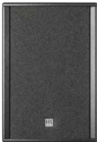
PR:O 12 D

This truly multifunctional cab gets the job done nicely as a satellite, as a compact 10"/1" fullrange cabinet, or as a low-profile stage monitor. Its balanced frequency response defeats feedback and the Music/Speech knob tunes the unit for the given application. The integrated DSP-based power circuitry delivers 1,200 watts. And all this makes the PR:O 10 XD a powerful and flexible sound reinforcement tool.