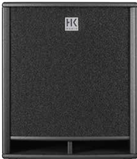
PR:O 18 SUB A

Featuring two 10" woofers in a bass reflex enclosure, this unit pumps out impressive low end with plenty of kick and surprising depth. Remarkably compact and weighing just 27.2 kg, this versatile unit may be placed upright or sideways. It is readily combined with mid/high units to configure a powerful yet unobtrusive easy-to-use system that delivers outstanding performance. In addition to the 600-watt power amp, the PR:O 210 SUB A is equipped with a stereo preamp for 2.1 setups.